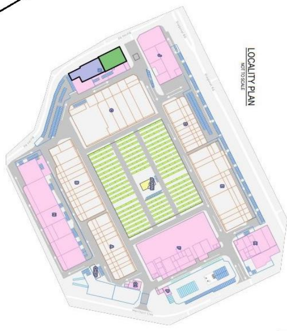
LOCALITY PLAN NOT TO SCALE